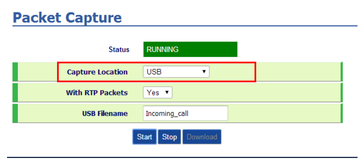
Figure 8: Capture to USB Drive

In the option Capture Location , User can select to store the capture file in phone's internal storage or extended USB storage. When the Capture Location is specified as USB, a USB drive must be connected. When USB is selected as the capture location, user can define the capture file name in USB Filename field. User can also define whether RTP packets will be captured or not from With RTP Packets option. Note: Only GXP2140/GXP2160 supports USB connection.